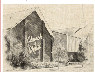
SCHEDULE OF SERVICES