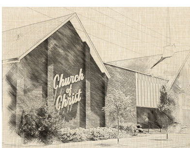
SCHEDULE OF SERVICES