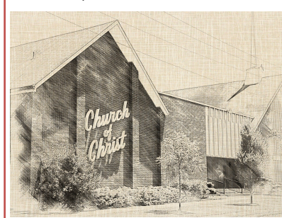
SCHEDULE OF SERVICES