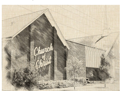
SCHEDULE OF SERVICES