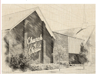
SCHEDULE OF SERVICES