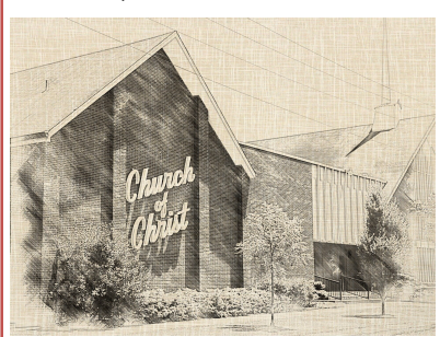
SCHEDULE OF SERVICES